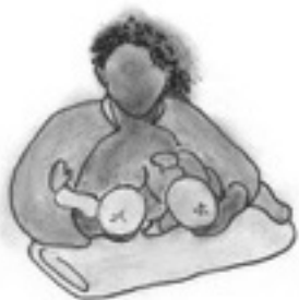
Double-Football with twins